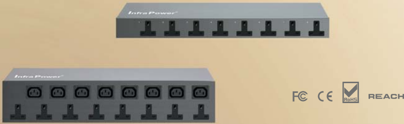
Basic PDU 230V

InfraPower Basic PDU is designed for cost efficient and reliable power distribution in data center. Customer can meet end to end equipment and management requirements using InfraPower whilst meeting budget and application demands.