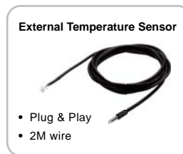
External Temperature Sensor