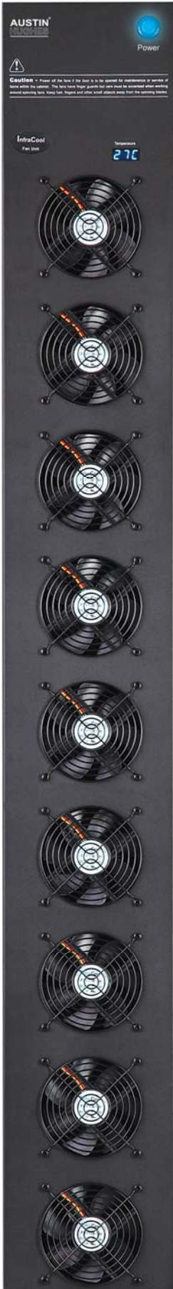
Front Door Cool Air In