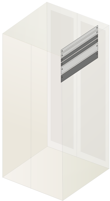
Side view :