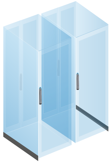
Part no. : PSK-1200D-NSR ( 1200 deep for left & right side )