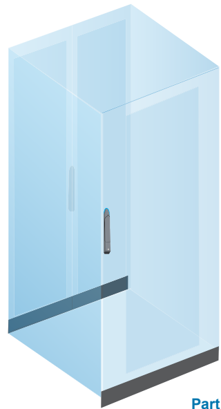
Part no. : PSK-800W-SR ( 800 wide for front & rear side )